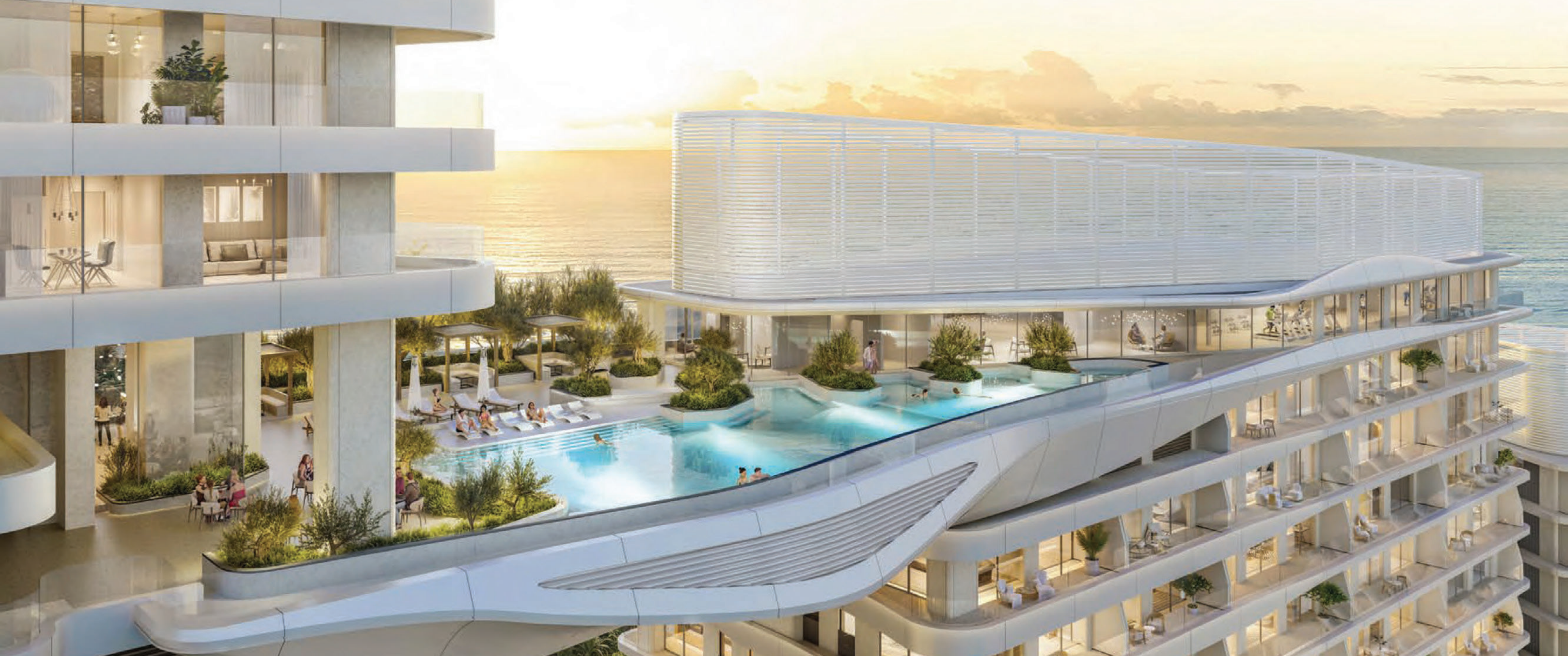
Adult Sky Pool