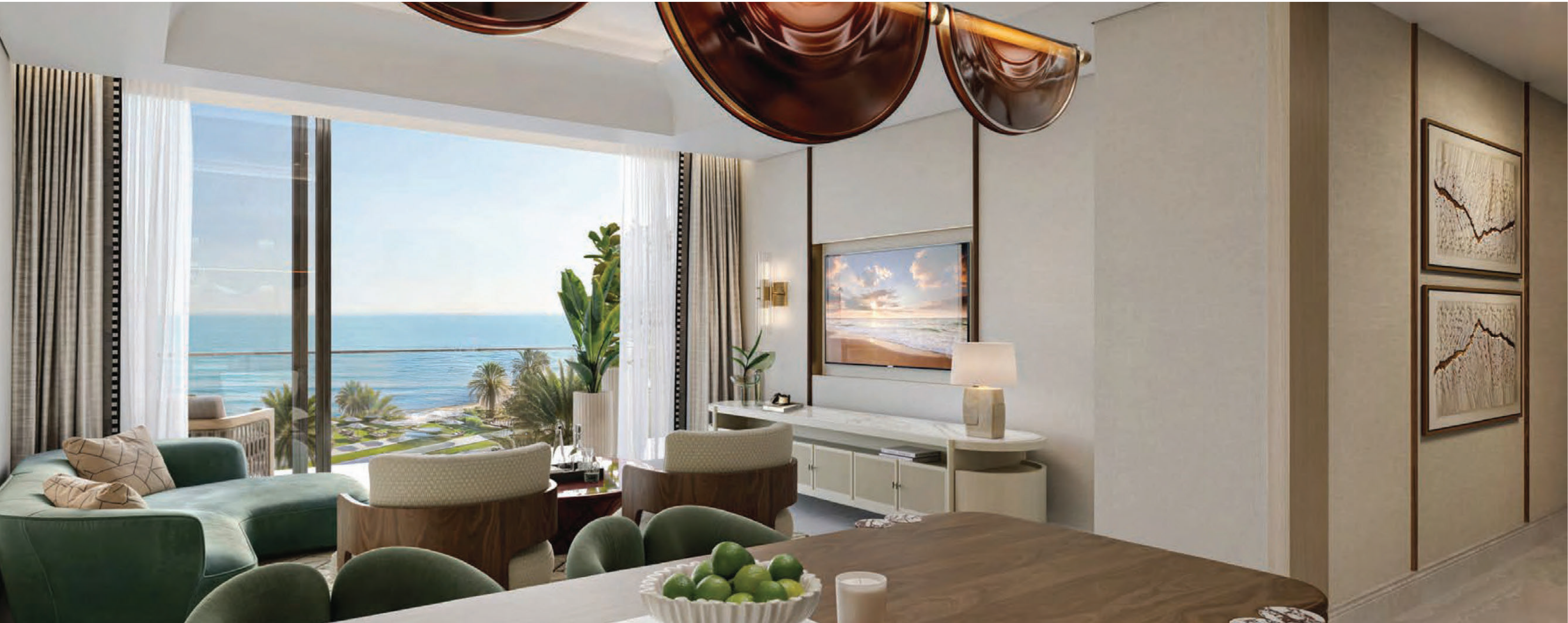
Two Bedroom Residences

Our expansive two-bedroom residences are a masterpiece of balance. Inside, everything speaks of refinement, from the tactile richness of materials to the modern design.